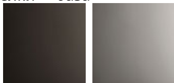
06 черный хром