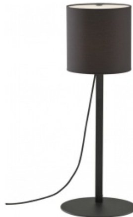
WALL LIGHT BLACK