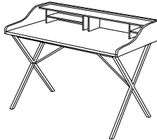
desk white lacquer from stock