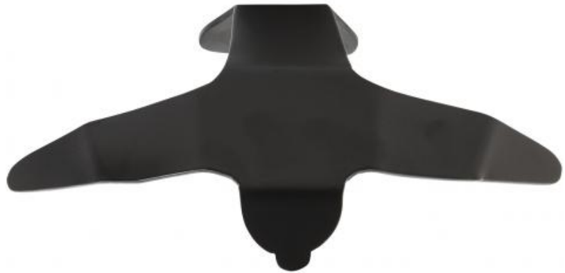
1 HOOK UP BLACK